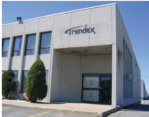
Our new 4,000 square foot location at 2367 Guenette

Customers eventually began asking that Trendex develop more up-to-date software. Soumitra and his staff redeveloped a seamless software package designed to improve customers' efficiency and service. For six months, Trendex tested the software at a customer site and worked along